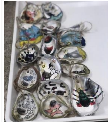
One of the student companies, called Meri, will sell shell ornaments to benefit ReClam the Bay.

M3 Jewelry Designs will feature “colorful pieces of wearable art,” with proceeds given to David’s Dream and Believe Cancer Foundation. Chroma’s founders created homemade coloring books for all ages, and profits will be directed to the Bellarine Theater Co. And Playflo, which will donate to Piece of the Puzzle Inc., set out to make “kid kits” that “encourage creativity through calming and playful activities for all children” in an effort to help reduce screen time.